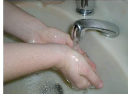
4 - Rinse