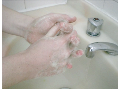
2 & 3 - Lather and Scrub