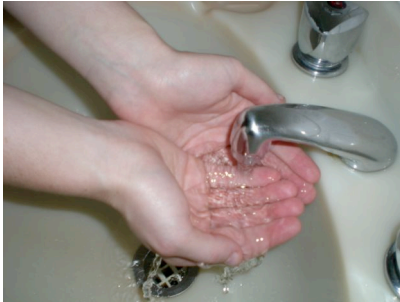
1 - Wet