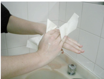
5 - Dry